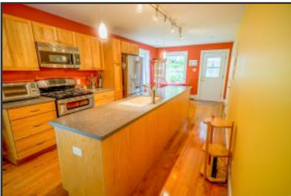
700 Beech kitchen.1