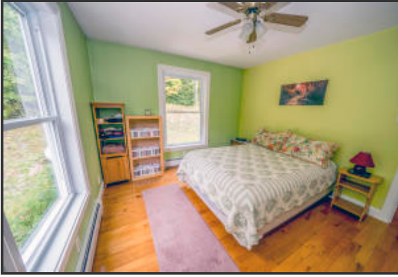
700 Beech BR.3