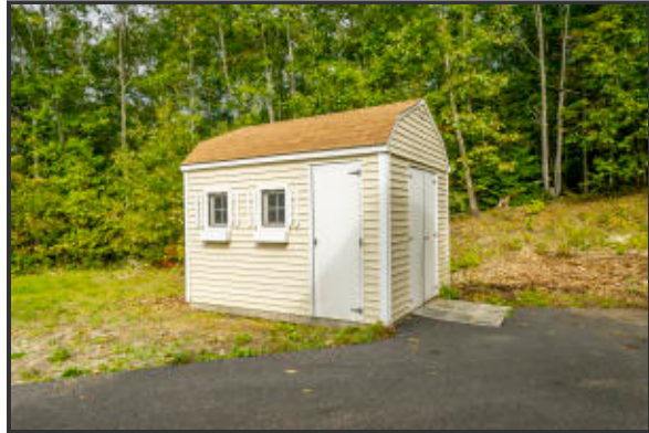
700 Beech shed