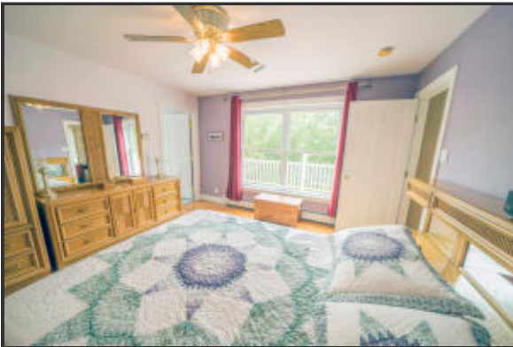
700 Beech Master.2