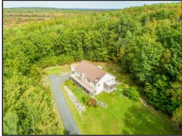
700 Beech ext.1