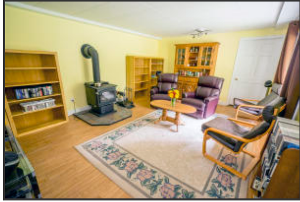
700 Beech fam room