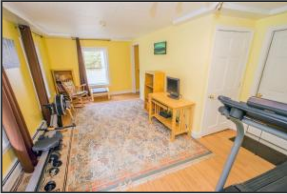
700 Beech office