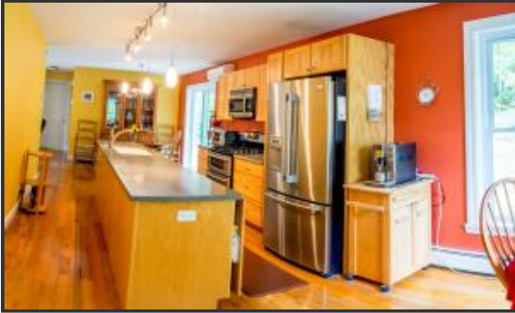
700 Beech Hill kitchen.2