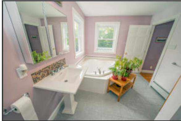
700 Beech master bath