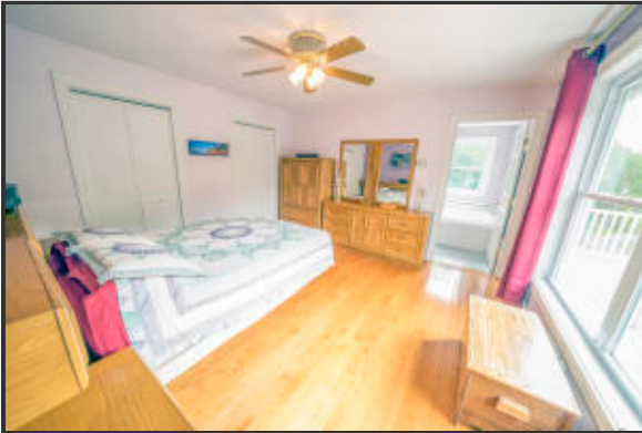
700 Beech master.1