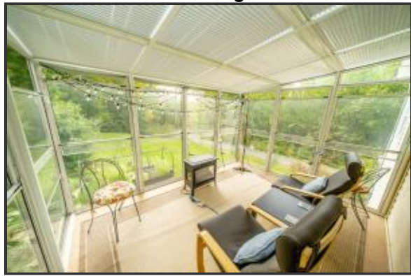
700 Beech glass