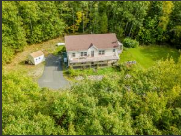
700 Beech ext.2