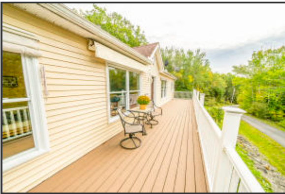
700 Beech deck