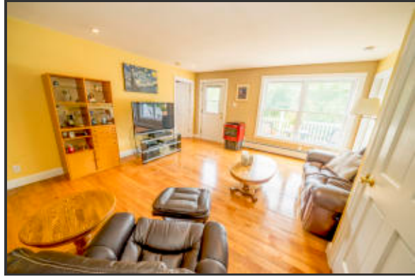
700 Beech LR.2