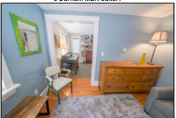
8 Durham MBR suite.4