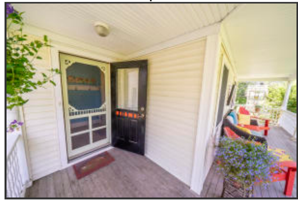
8 Durham porch door