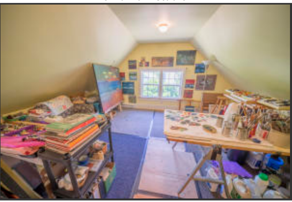
8 Durham studio