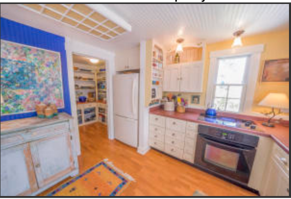
8 Durham kitchen.pantry