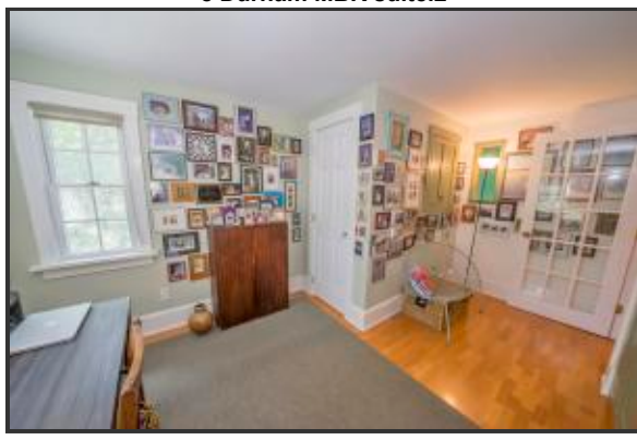
8 Durham MBR suite.2