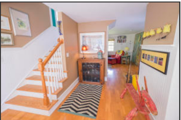
8 Durham stairwell