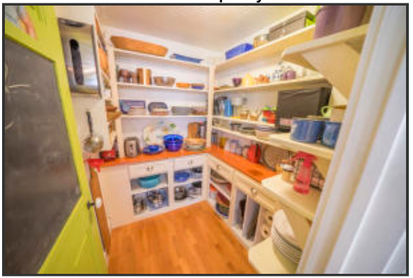
8 Durham pantry