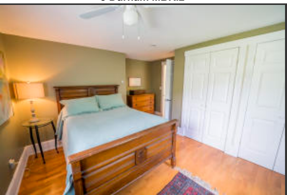
8 Durham MBR.2