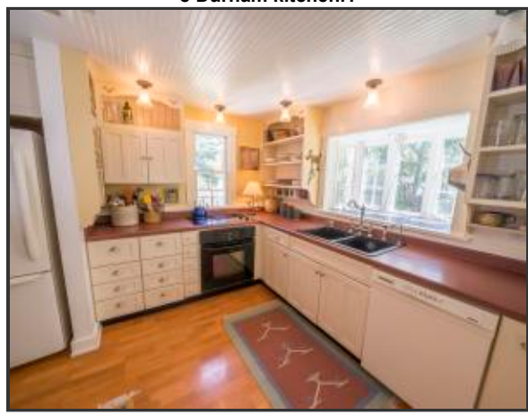
8 Durham kitchen.1