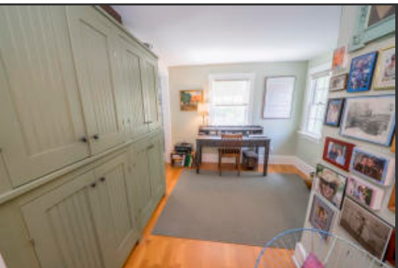
8 Durham BR Suite.1