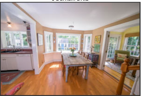
8 Durham DR.2