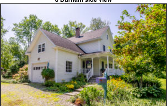
8 Durham side view