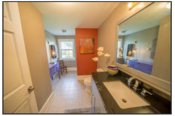
8 Durham MAster bath