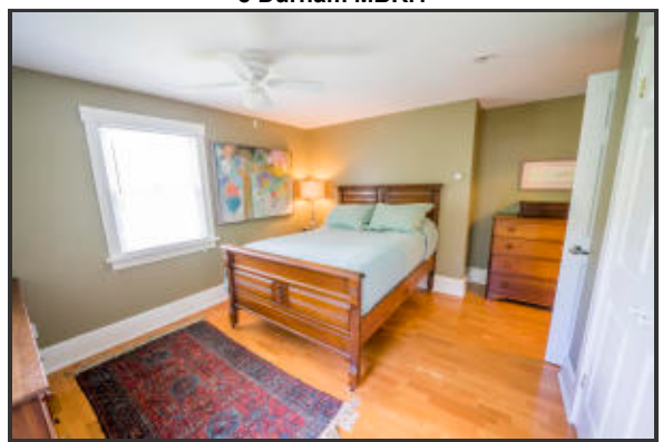
8 Durham MBR.1